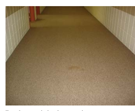
Replace original carpeting