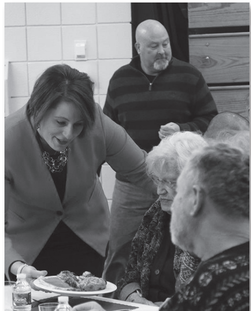
The story and more pics on pg. 7