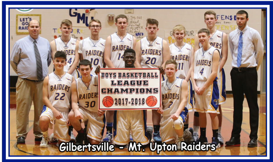
Gilbertsville - Mt. Upton Raiders

Budget Hearing: May 8, 2018, 6:30 PM, D131