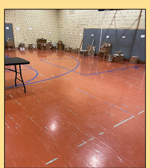
Paint Elementary School Gym and Replace Floor