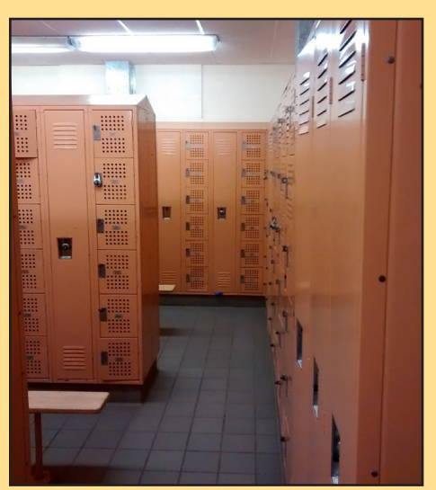
Girls' Locker Room Locker Replacement