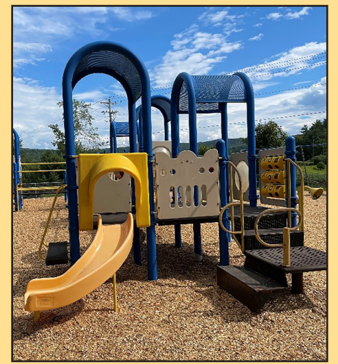
New Playground Installation at Rear of Building