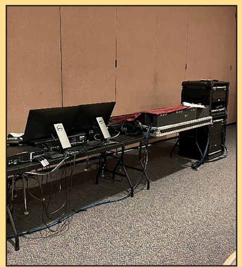
Create Auditorium Control Booth