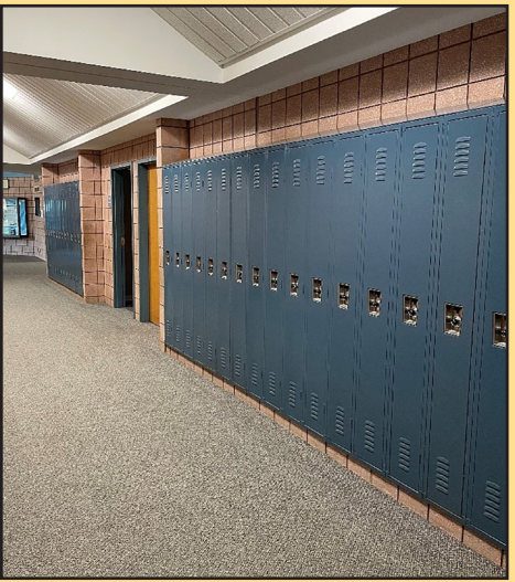
Corridor Locker Replacement