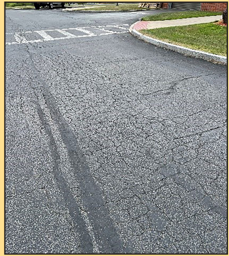
Driveway and Parking Lot Reconstruction