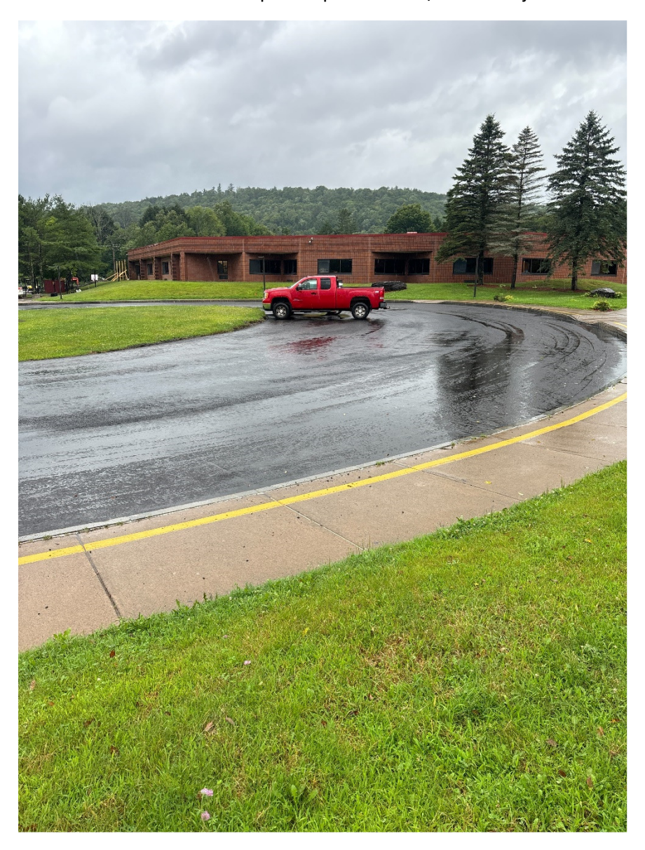
GMU CSD – 2023 Capital Improvements / Boiler Project

Friday 8/09/24: Main Drive Bus Loop – Application of Asphalt Binder Course completed. Application of Top course to be performed next week.