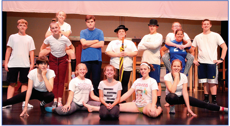
The cast of Mary Poppins, which will be performed at GMU at 7 p.m. on November 9-10.