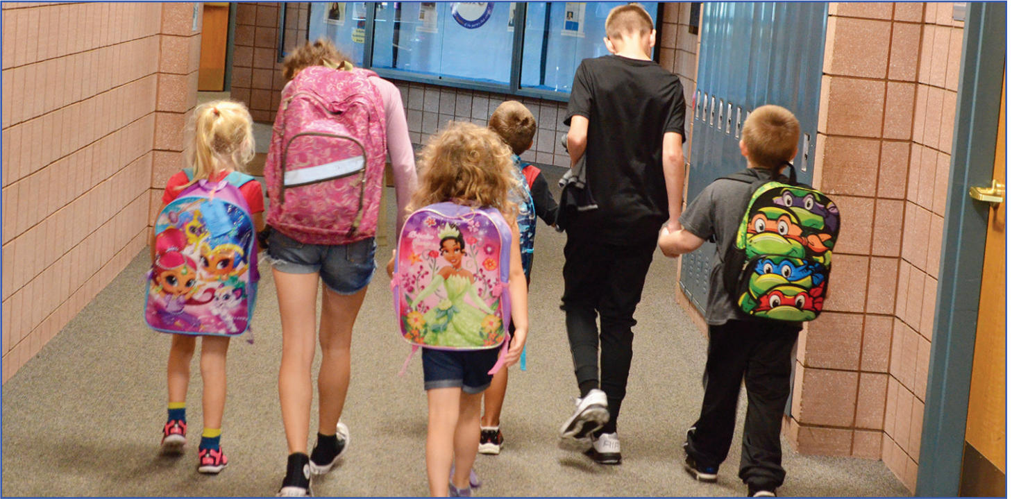
Seventh graders walk kindergartners to the bus at the end of a week of school.